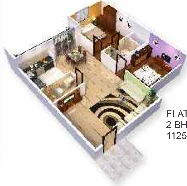
FLAT-6 2 BHK 1125 Sft