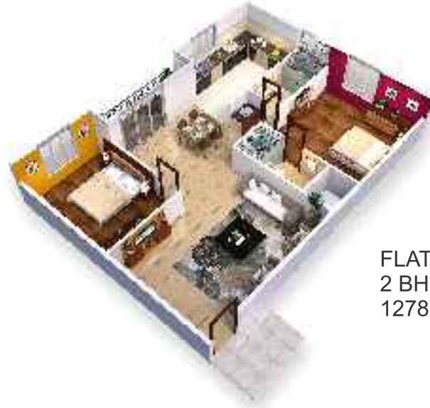
FLAT-5 2 BHK 1278 Sft