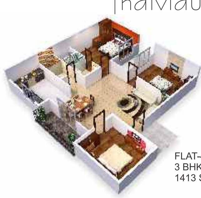
FLAT-4 3 BHK 1413 Sft