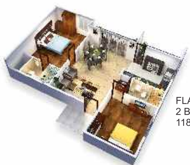
FLAT-2 2 BHK 1188 Sft