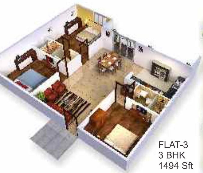
FLAT-3 3 BHK 1494 Sft