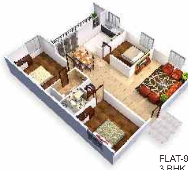
FLAT-9 3 BHK 1521 Sft