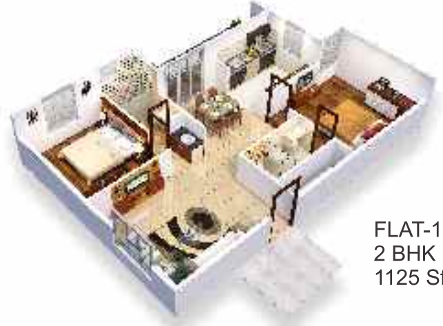
FLAT-1 2 BHK 1125 Sft