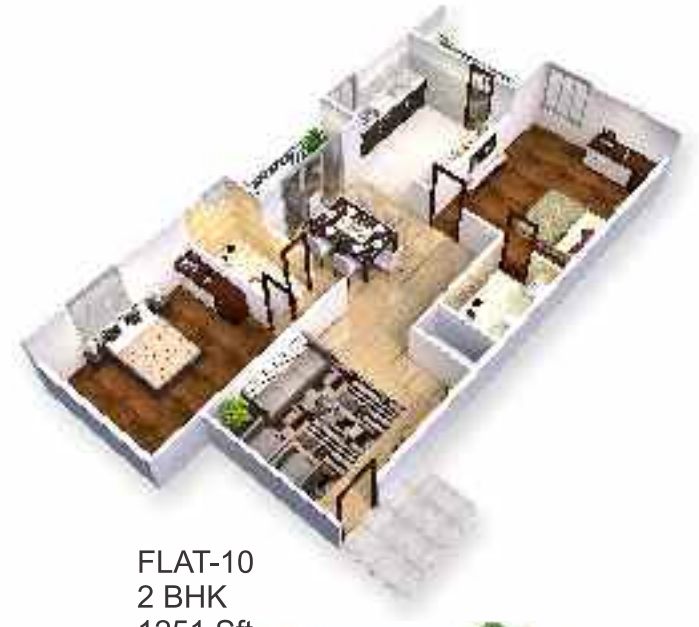
FLAT-10 2 BHK 1251 Sft