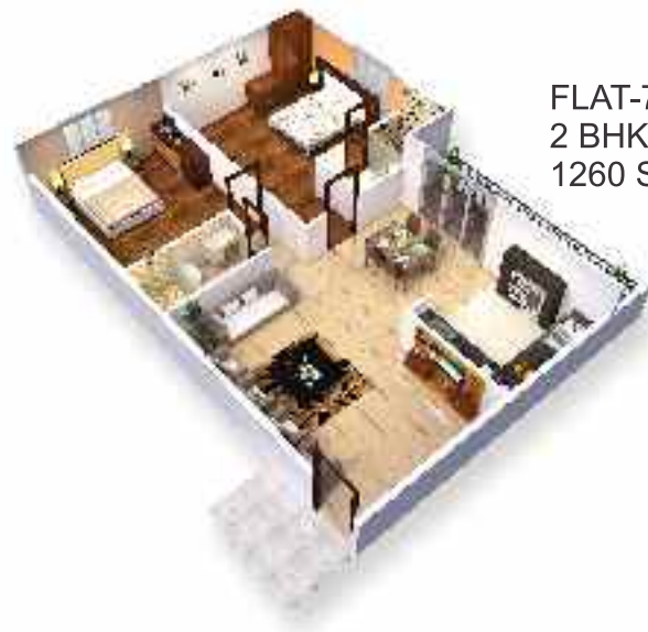
FLAT-7 2 BHK 1260 Sft