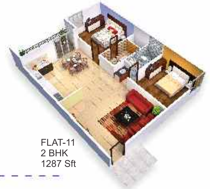
FLAT-11 2 BHK 1287 Sft