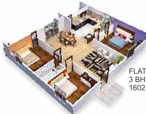
FLAT-8 3 BHK 1602 Sft