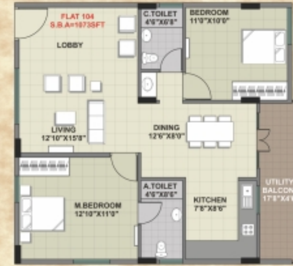
104, 204, 304 and 404 - 2BHK 1073 Sft.(West)