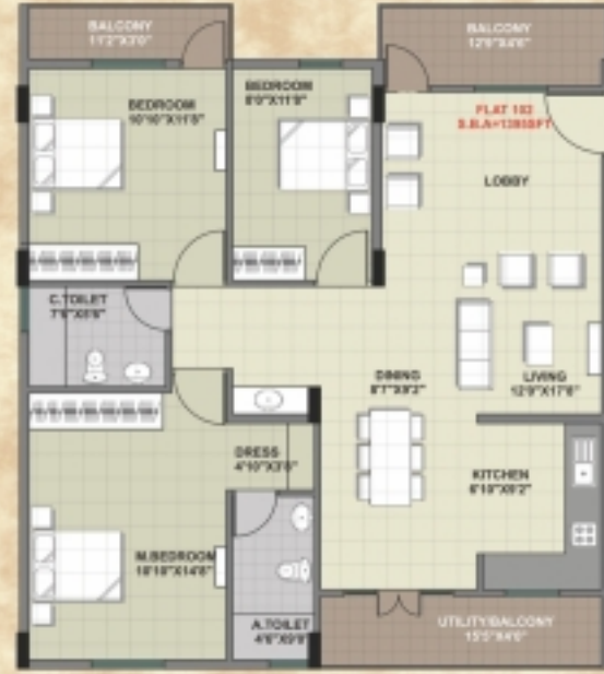
102, 202, 302 and 402 - 3BHK 1395 Sft.(East)