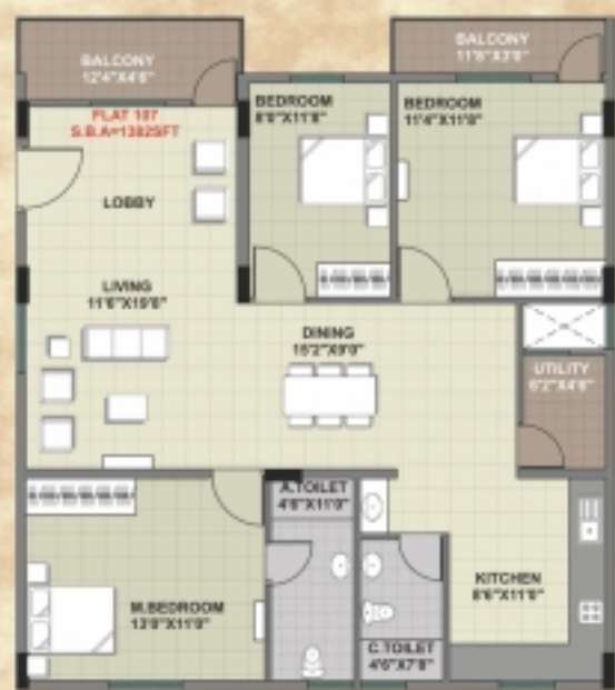
107, 207, 307, and 407 - 3BHK 1382 Sft.(West)