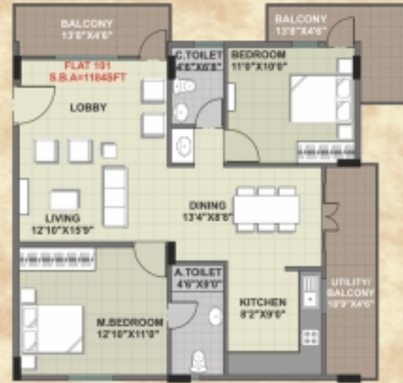
101, 201, 301 and 401 - 2BHK 1184 Sft.(West)