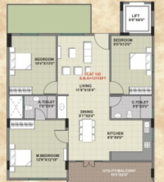
105, 205, 305, and 405 - 3BHK 1311 Sft.(North)