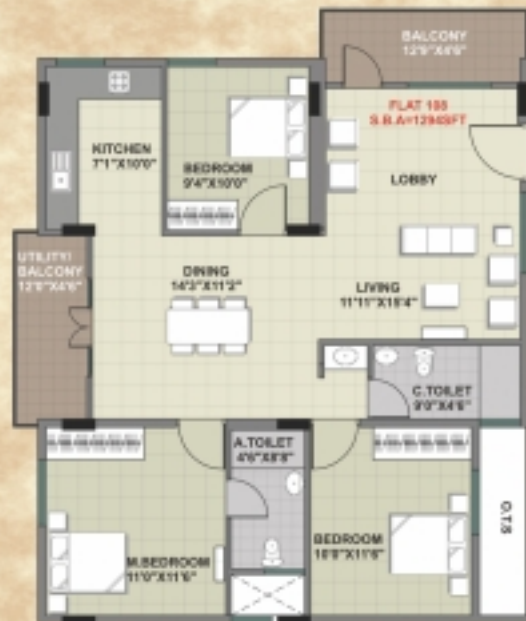
108, 208, 308 and 408 - 3BHK 1294 Sft.(East)