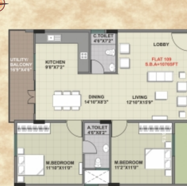
109, 209, 309 and 409 - 2BHK 1076 Sft.(East)