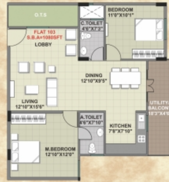
103, 203, 303 and 403 - 2BHK 1080 Sft.(West)