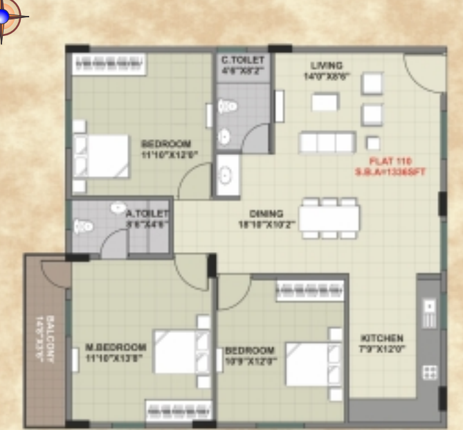
110, 210, 311 and 410 - 3BHK 1336 Sft.(East)