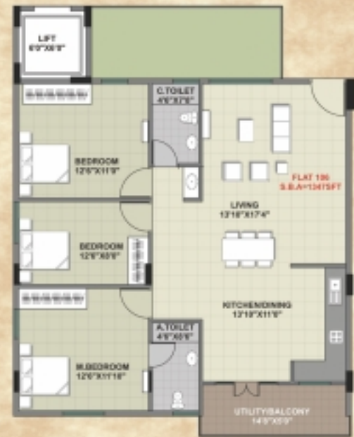
106, 206, 306 and 406 - 3BHK 1347 Sft.(North)